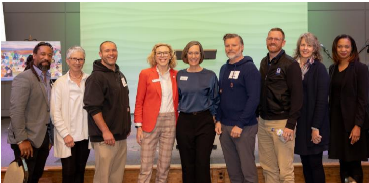
GHA Steering Committee Members at the 2022 iGNITE Luncheon.

*This list reflects contributions made from 12/12/21 – 12/12/22.